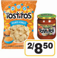
TOSTITOS CHIPS 205-295g or SALSAS 418-430mL • Assorted 2/8.50