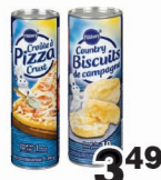
PILLSBURY PIZZA CRUST or COUNTRY BISCUITS 340g 3.49