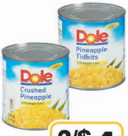
DOLE PINEAPPLE 398mL • Assorted 2/$4