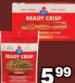
MAPLE LEAF READY CRISP BACON SLICES 65g or BACON BITS 85g Assorted 5.99