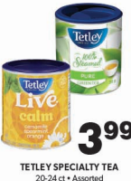
TETLEY SPECIALTY TEA 20-24 ct • Assorted 3.99