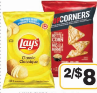
LAY'S CHIPS 235g • Family size or POPCORNERS 142g • Assorted 2/$8