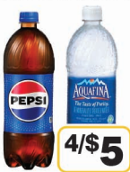
PEPSI PRODUCTS 1L • Assorted or AQUAFINA WATER 1L 4/$5