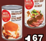
SWISS CHALET GRAVY and DIPPING SAUCE 284mL • Assorted 1.67