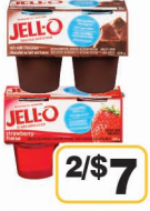
JELL-O PUDDINGS or GELS 4 pk • Assorted 2/$7