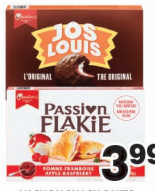
VACHON SNACK CAKES 220-410g • Assorted 3.99