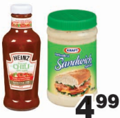
KRAFT SANDWICH SPREAD 475mL or HEINZ CHILI SAUCE 455mL 4.99