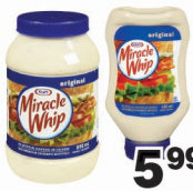
KRAFT MIRACLE WHIP 650mL Squeeze or 890mL • Assorted 5.99