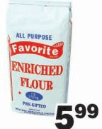
FAVORITE FLOUR 7 lb Bag 5.99