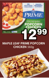
MAPLE LEAF PRIME POPCORN CHICKEN 560g 12.99