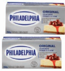
PHILADELPHIA CREAM CHEESE 250g Brick • Original only 4.99