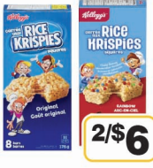
KELLOGG'S RICE KRISPIES SQUARES 176-220g • Assorted 2/$6