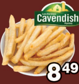
CAVENDISH CLEAR COAT CRISPY FRIES 4.5 lb 8.49