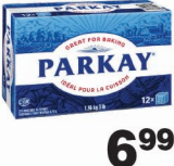
PARKAY MARGARINE 3 lb • 1/2 cup squares 6.99