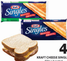
KRAFT CHEESE SINGLES 410g • Assorted 4.99