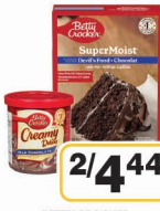
BETTY CROCKER CAKE MIXES 375-461g or FROSTINGS 340-450g • Assorted 2/4.44